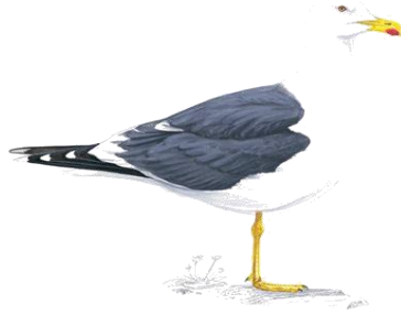
Lesser black-backed gull

One of the most common birds in any coastal town!